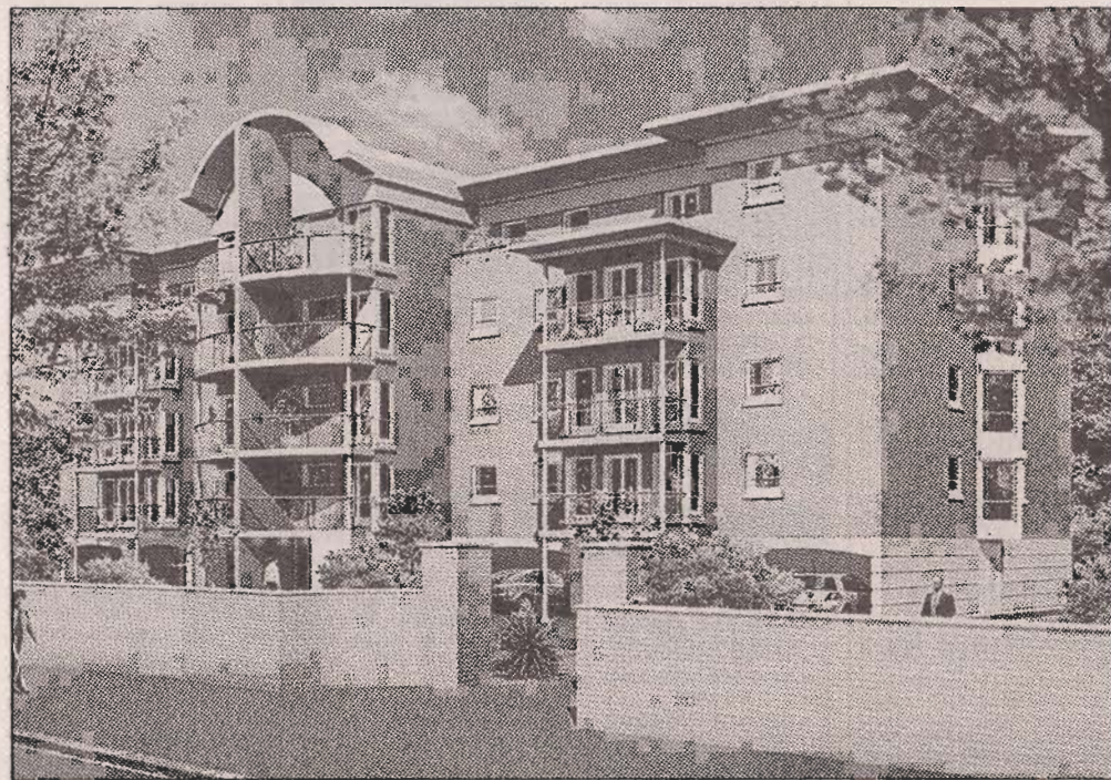
The missing link: ConneXtion provides the smart apartments Bromley commuters have been waiting for

Morgan Restoration is a local developer that specialises in upmarket conversions with a modern edge. Its latest project is the transformation of a listed Georgian mansion set in five acres of woodland, in Bexley, into loft-style apartments.