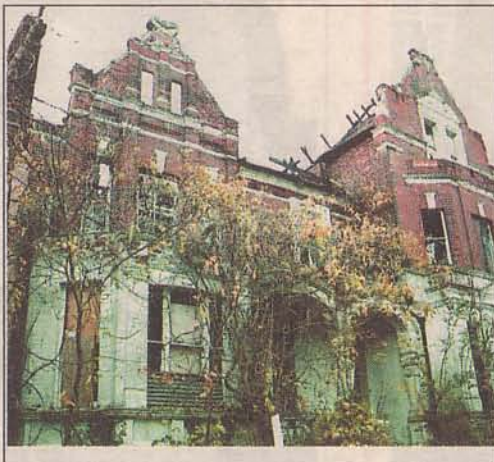
● The Victorian villa in Sundridge Avenue